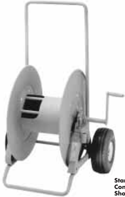
Standard Configuration Shown